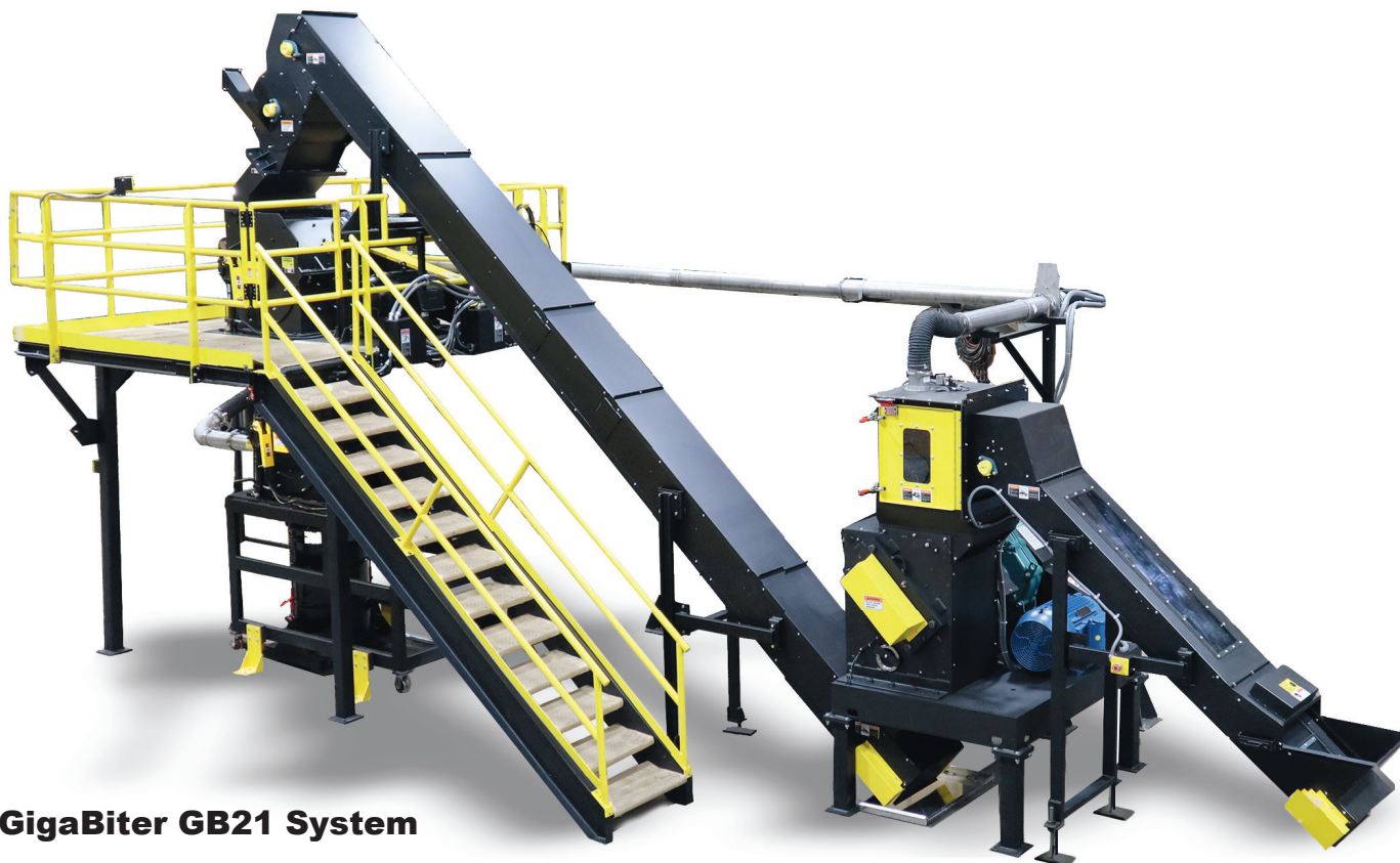
GigaBiter GB21 System

The GB21 System is listed on the NSA/CSS Evaluated Products List and designed to process the information bearing components of HDD's, SSD's, cell phones, circuit boards, thumb drives, etc.