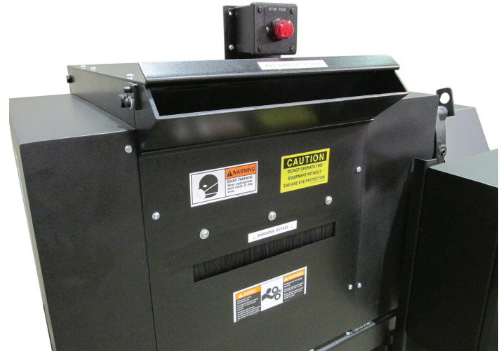
GB18 Particle Cut Shredder

The GB18 Particle Cut Shredder offers the perfect combination of security and efficiency. Compact and heavy duty with a small footprint and optional output conveyor.